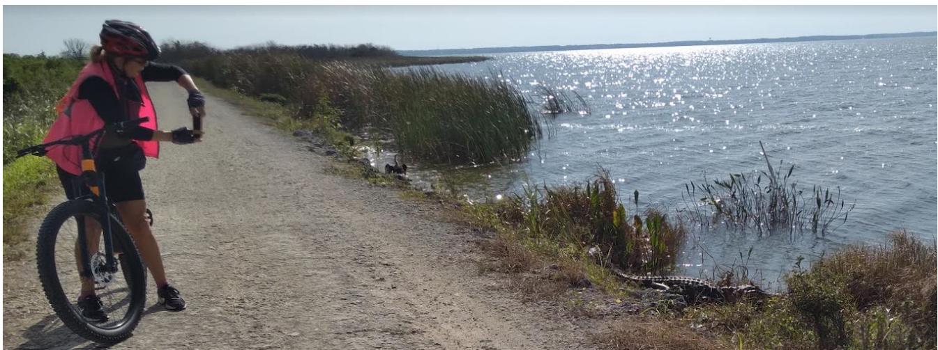
Sometimes we'll be up close to alligators. They're more interested in basking in the sun than they are in us but always use caution around them. Bikers and pedestrians are also around so watch for them too.