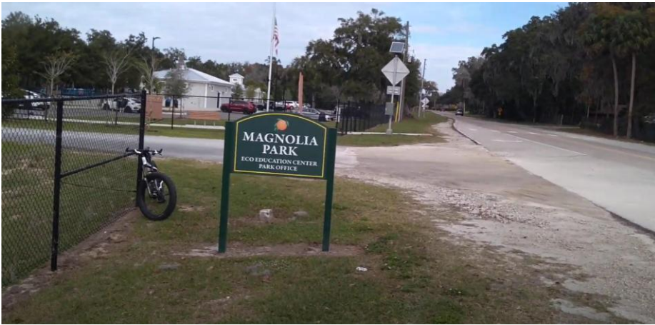
Turn into the parking lot here.